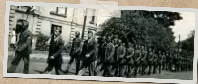
Engineers parading in 1944, possibly Victoria Road in Diss

The 923rd Regiment of Aviation Engineers consisted of four Battalions, including the 827th. Most engineers in the 923rd were African American, with 162 officers to 3,268 African American servicemen. The 827th, stationed at Weybread during 1944-45, was made up of 30 to 35 mainly white officers and between 740 to 770 African American engineers. This was a time when segregation was still an accepted part of American life, particularly in Southern states, but extended to all the US forces.